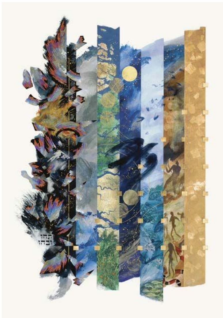
Genesis 1 – The Saint John's Bible

We welcome you to worship this morning. Our celebration is joyful, reflective, playful and reverent, as we thank God for new life through Jesus Christ in the power of the Holy Spirit.