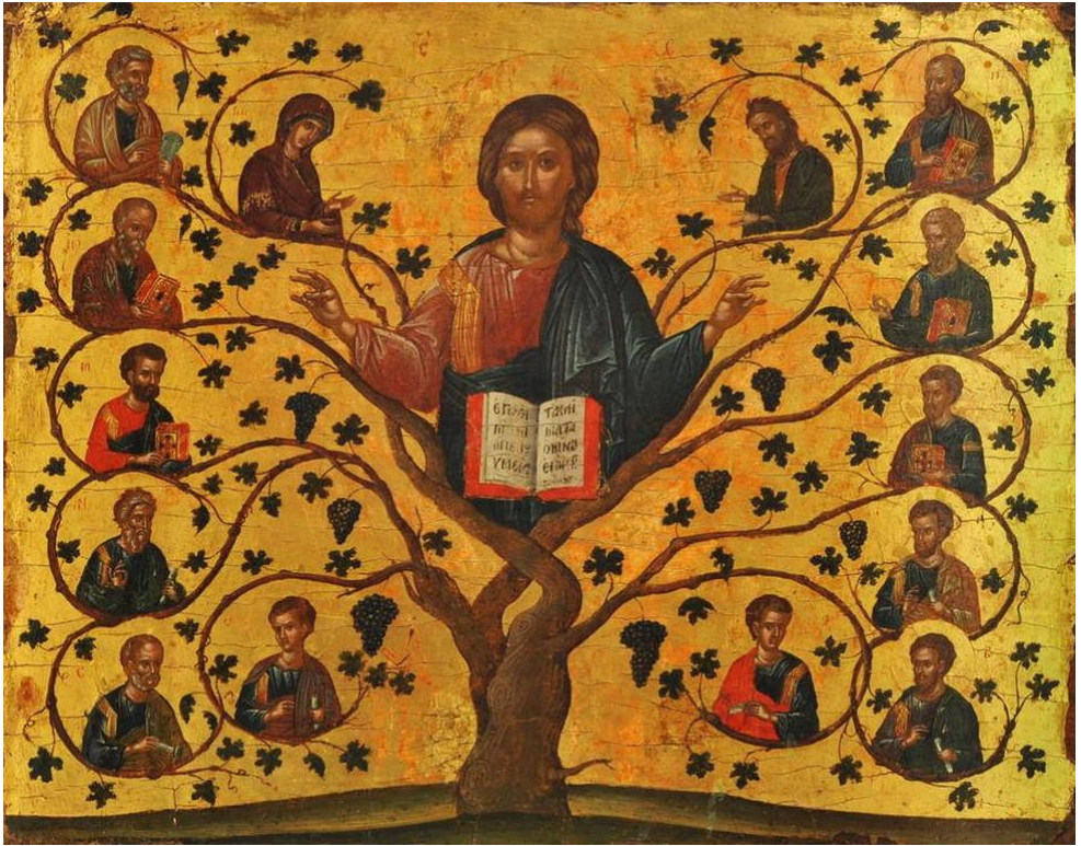
Christ the Vine

Artist Unknown (in the Style of Angelos Aktantos) c. 1400 -1600